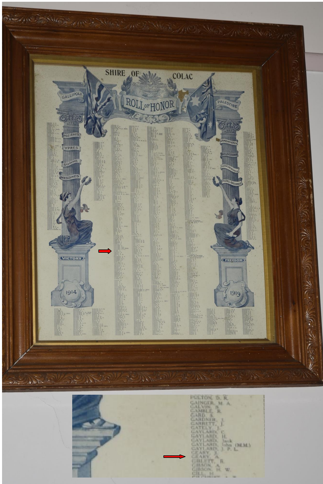
Shire of Colac Roll of Honor