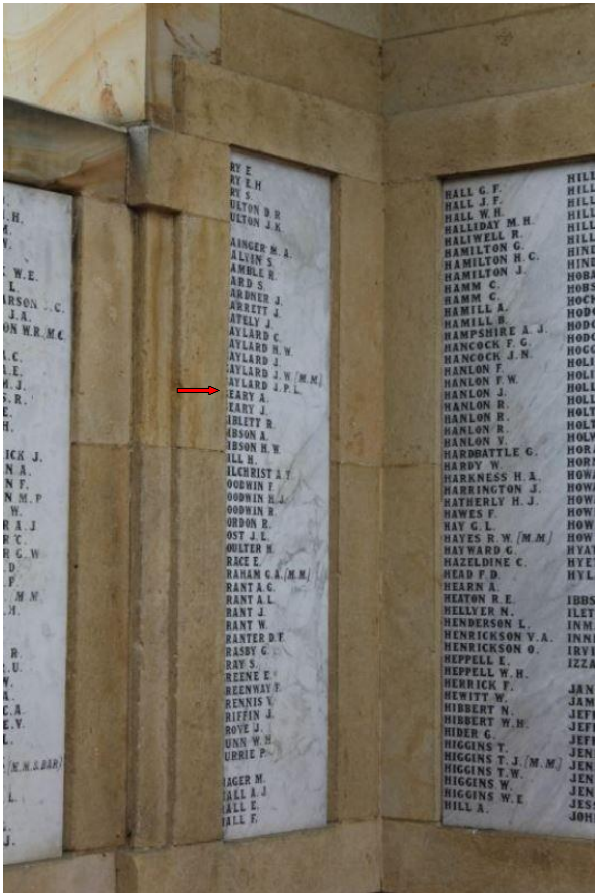
Colac Soldiers' Memorial