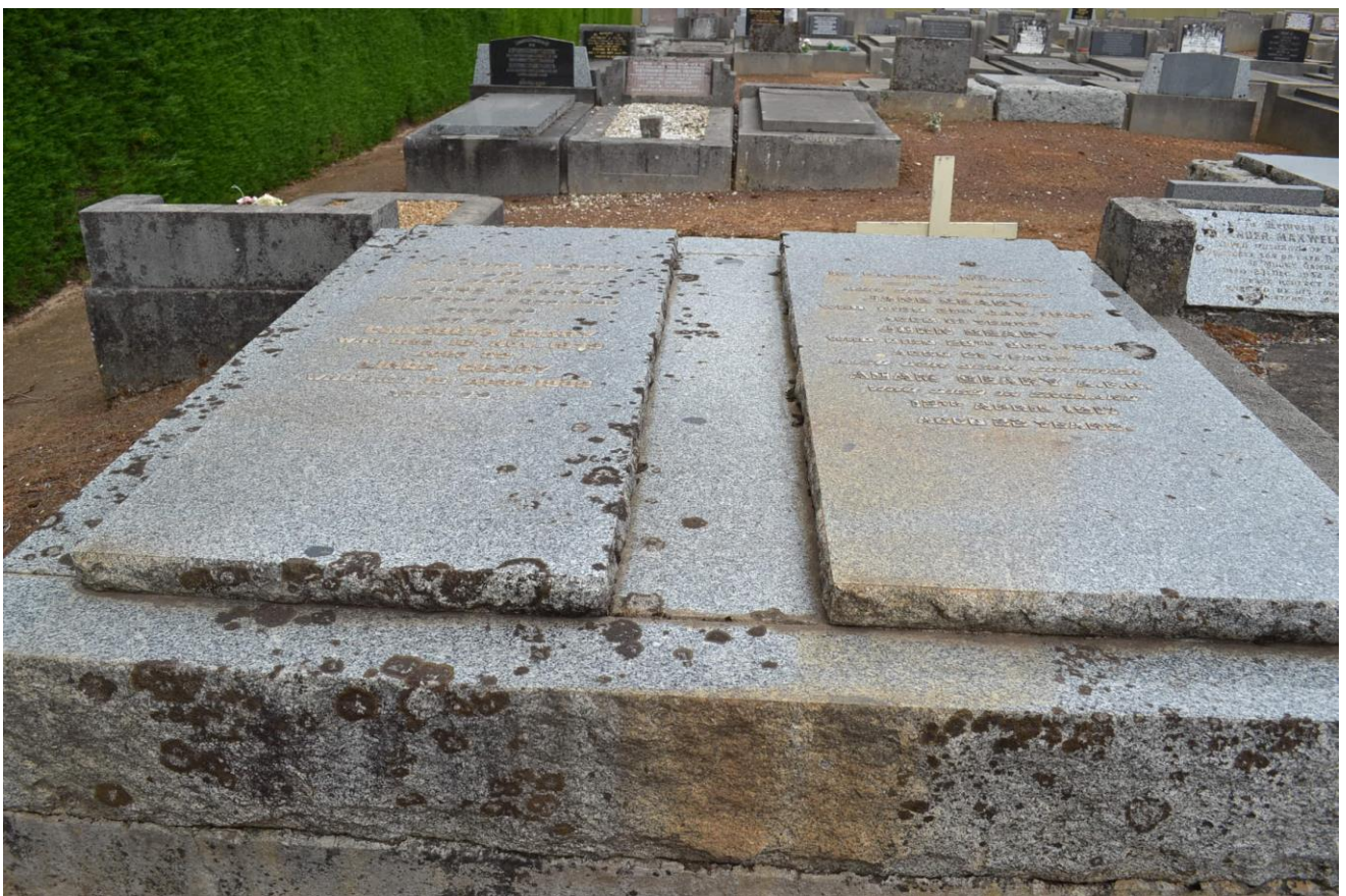
Geary Family Plot in Colac Cemetery