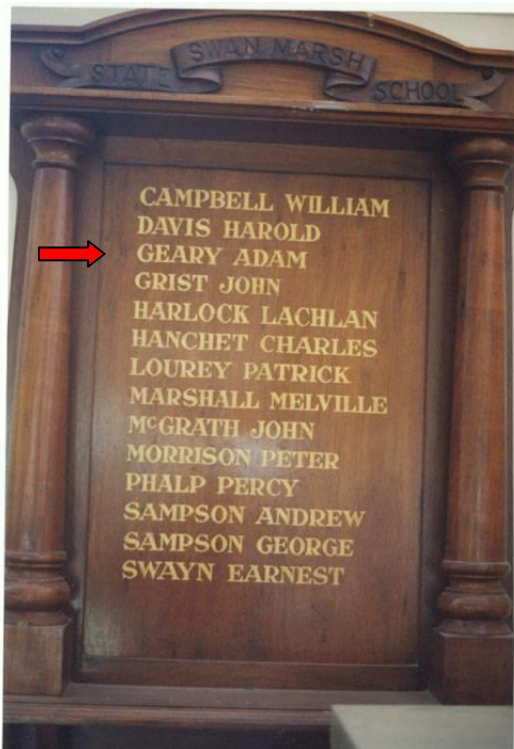
Swan Marsh State School Roll of Honour